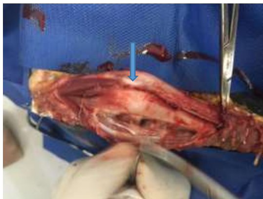
Figure 3: Intra-operative image of the malunion radius & ulna