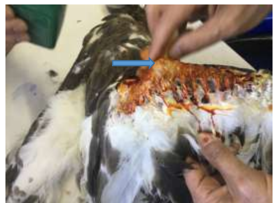
Figure 1: An adult female golden eagle ( Aquila Chrysaetos ) with angular malunion fracture of radius and ulna

closing-wedge osteotomy was performed at the point of the greatest deformity of the ulna and radius by means of an oscillatory bone saw irrigated with 0.9% saline solution (Figure 3). After correction and aligning of the bones, the ulnar fracture was fixed with 2 mm Kirschner wire by retrograde intramedullary pinning method. The radius was fixed with an 1mm intramedullary pin via a shuttle method. The surgical site was vigorously irrigated with physiologic saline and muscles and subcutaneous tissues were sutured with simple continuous suture pattern using no. 3/0 catgut (Pezeskyaran, Tehran, Iran). The Skin was sutured with the same suture pattern using no. 2/0 nylon (Pezeskyaran, Tehran, Iran). Antibiotic therapy with enrofloxacin (Razak, Tehran, Iran) (20 mg/kg IM) was begun immediately after anesthetic induction and continued orally for 4 days. A figure-of-eight bandage was placed on the right wing, and the wing was bandaged to the body. The bandage was changed twice every five days and removed after 15 days. The owner of the bird was advised to keep the bird in confinement. Immediate postoperative radiographs showed correction of bone malalignment (Figure 2b). Although the recovery from the anesthesia was prolonged, but the bird was discharged without any complication. Case follow up showed an uneventful improvement and 6 weeks later the ulna pin was removed, but the radius pin was remained.