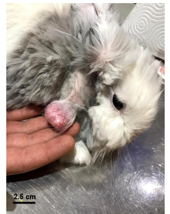
Figure 1: Gross appearance of the rabbit's cutaneous trichoblastoma as a pedunculated, movable and oval shape mass measuring 3×1.5×1 cm located between the mandible and neck.