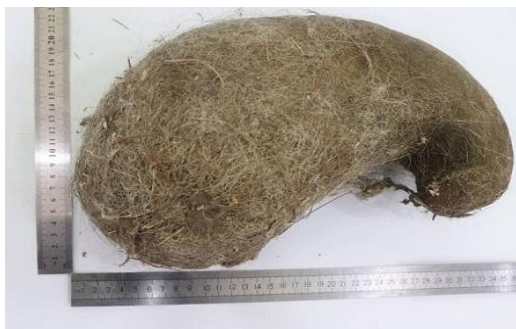
Fig 3. Giant bezoar after necropsy