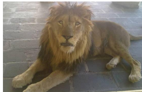
Fig1. Poor body condition score was noted on the trichobezoar affected lion

appetite and feeding behavior were acceptable until the lion showed signs of acute anorexia; however during daily cleaning of the enclosure and close observation, keepers found no other evidence. At the evening the animal showed vomiting of semi-digested food, abdominal pain with restlessness and suddenly turned to the recumbent position at the 10 pm. When the clinical sign was reported to the clinician, the lion was in the hypovolemic shock. Immediately, the animal was taken into squeeze cage, the IV catheter was fixed, blood sampling was done and hypertonic fluids therapy was started.