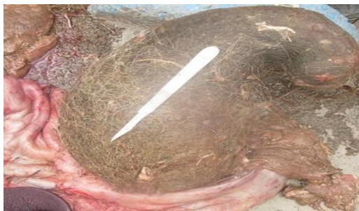
Fig 2. The stomach was completely filled with huge trichobezoar mass weighted 3800 grams.

(1.058), and increased cellularity dominated by degenerated neutrophils and macrophages, and many coccobacillus bacteria were seen in the Geimsa staining. The complete blood count showed elevated hematocrit (68%), sever leukocytosis (49000/ \mu l), neutrophilia, shift to left and toxic change. Biochemical evolution showed elevated globulin (6 mg/dl), BUN (134 mg/dl) and creatinine (5.2 mg/dl) level. Samples were obtained from esophagus, stomach, liver, spleen, small and large intestine and sent for histopathological examination. Necrosis and sloughing of the gastric mucosa (Fig. 4) and presence of fibrinopurulent exudate in the gastric serosa (Fig. 5) was reported. The gastric outlet obstruction and perforation, focal peritonitis and endotoxic shock was diagnosed as the main death factors based to the leukemoid reaction in hematological evaluation, cytological and histopathological findings. However surprisingly, except gradual weight loss; the animal did not show any obvious clinical sign of severe gastric impaction before death which could facilitate the fast diagnosis.