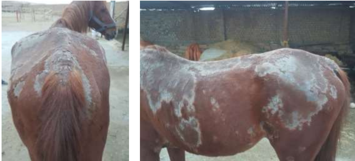
Figure 2: Shape and distribution pattern of skin lesions related to the second involvement of a 9 years old chestnut thoroughbred stallion. Right) Lateral view of the body, withers, chest, back and croup. Left) Posterior view of the body.

Vesiculobullous to pustular lesions with acantholytic features (decreased connectivity and continuity between keratinocytes) were observed in cutaneous histopathology (Figure 3). Primary blisters appeared as acantholysis under the stratum corneum and in the stratum granulosum. The severity of the lesions was clearly milder than typical histopathological lesions, which seems to be due to glucocorticoid treatment before biopsy. The stratum corneum was thin due to removal of the superficial layer, but the deeper areas of the epidermis were intact. Small vacuoles were observed in the intercellular space of primary lesions in the upper parts of the epidermis, and surface cracks or blisters were created from the connection of these vacuoles in the upper parts of the stratum granulosum or immediately below the stratum corneum. Older lesions were acantholytic, papillomatous and hyperkeratotic with focal parakeratosis. In these granular lesions, keratinocyte changes were observed, distinguishing pemphigus foliaceus from pemphigus vulgaris (Figure 3). Eosinophilic and neutrophilic infiltration was observed in the dermis.