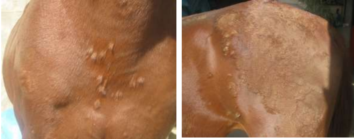
Figure 1: Skin lesions related to the first involvement of an 8 years old thoroughbred chestnut stallion; Left) Large separated bullae of the chest area. Right) distribution pattern of lesions on hindquarter area, lichenification and leathery skin.