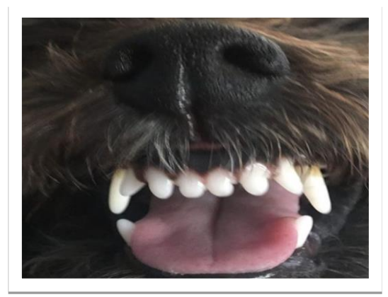
Figure 7: Full wearing signs in the maxillary central incisor in a 48-months-old Terrier dog

Completion of wearing can be seen in the middle incisor of the maxilla from 48 to 60 months old. The onset of wearing is visible on the mandibular corner incisor and then on the maxillary side as well as the canines.