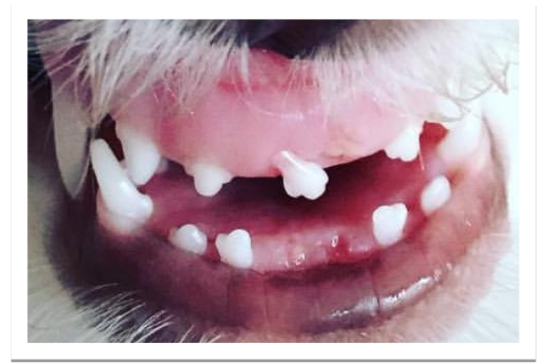
Figure 2: The onset of deciduous teeth falling out to replace permanent teeth in an 8-weeks-old Terrier dog

The deciduous teeth begin to fall out to replace permanent teeth from week 6 to week 8 (figure 2).