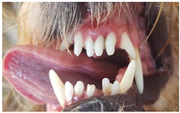
Figure 4: The presence of both deciduous and permanent canines in a 6 months old Terrier dog