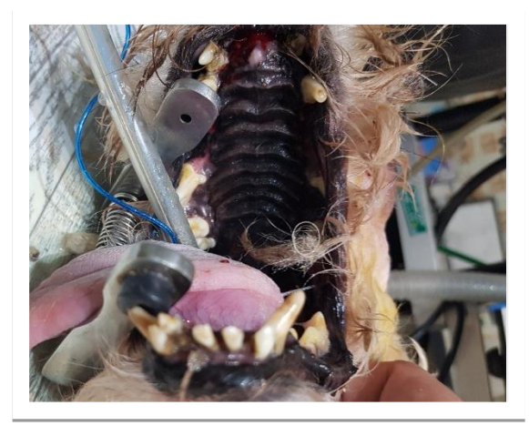
Figure 9: Maxillary central incisor (I1) falling out and inclination of teeth seen in 14 years old Terrier dog