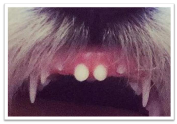
Figure 3: Permanent central incisor newly erupted in a 3-months-old Terrier dog

The complete permanent teeth are observed from 7 to 8 months old. The complete permanent teeth arrangement can be seen at this age in a dog.