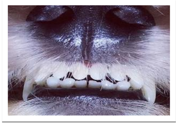
Figure 5: The onset of incisor wearing in a 14months-old Terrier dog